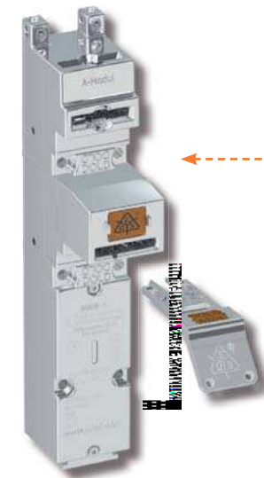
Example: STS-Unit SX01A